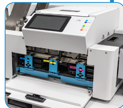
Clamshell design offers easy front access to ink tanks and paper path